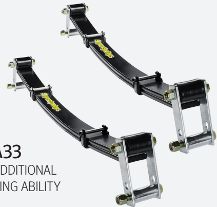
SSA33 5,800 (lb) ADDITIONAL LOAD-LEVELING ABILITY