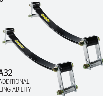
SSA32 2,800 (lb) ADDITIONAL LOAD-LEVELING ABILITY